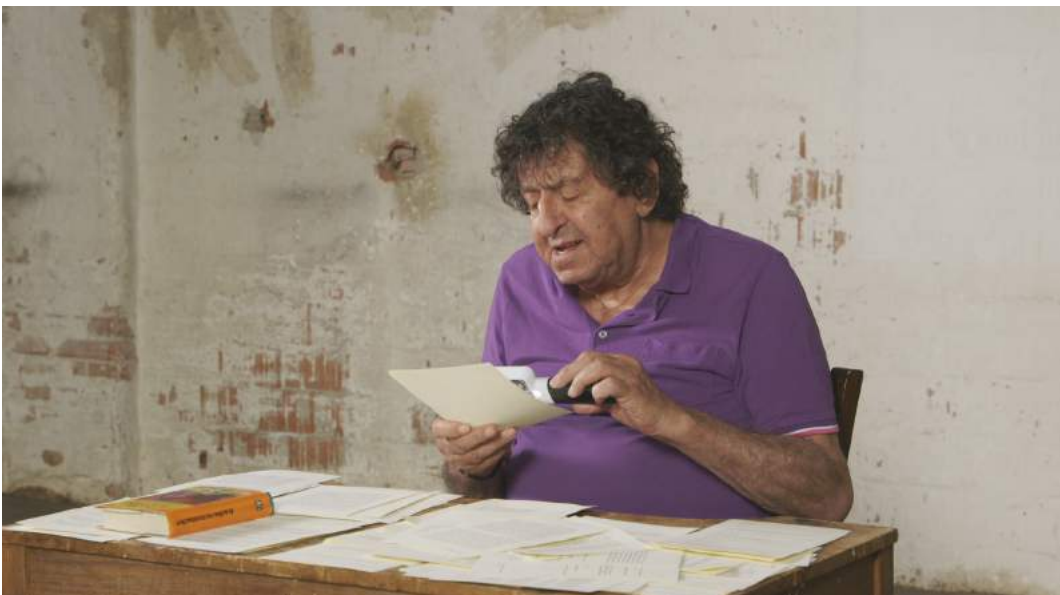
Press notes MUTZENBACHER Berlinale 2022